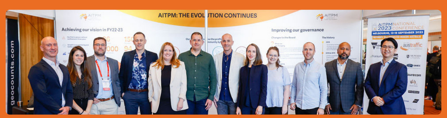
The 2023 Victorian Conference Committee

"We're keen to hear from members with great ideas and anyone who'd be interested in volunteering their time. I warmly invite any AITPM members in Western Australia to be in touch."